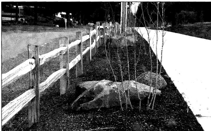
An old-time, cedar split-rail fence follows a 10-foot wide concrete section of the new trail.

The other notable part of the project is a wooden bridge that spans a wet weather creek. The size of the bridge is not that impressive—50 feet long and 10 feet wide, weighing 15,000 pounds. It is the way it got there that is interesting. Fabricated by RLD Company, Inc. in Vancouver, Wash., the structure was trucked to the site and then lifted by a Campbell