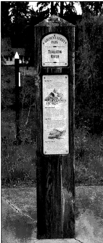
Three historical markers are some of the aspects of the trail project that required a general contractor with a wide variety of strengths.

We are proud to be part of the Greenway and Sweek Pond Trail, led by Landis & Landis Construction.