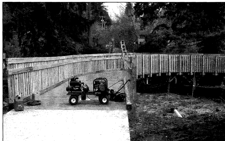
A unique feature of the trail is an 810-foot wooden boardwalk that is resting on 180 wetland-friendly pin foundations.