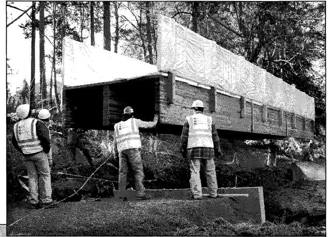
(left) A Campbell Crane lifts a 15,000-pound wooden bridge 180 feet in the air and 210 horizontally...